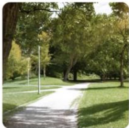
SPRAWLING GREEN SPACES