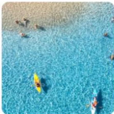
OVERLOOKING CRYSTAL LAGOON