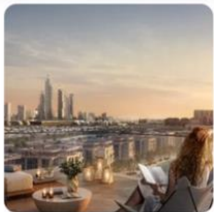
ROOFTOP LOUNGE WITH A TERRACE IN TOWER 1