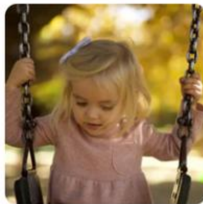
SHADED KIDS POOL AND PLAYGROUNDS