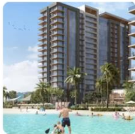
DIRECT ACCESS TO THE CRYSTAL LAGOON AND ITS BEACH